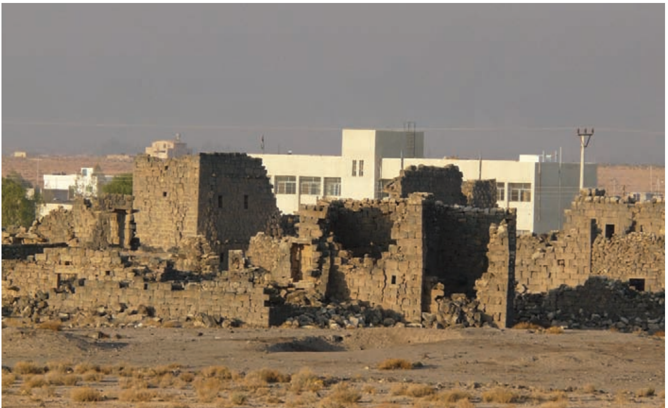
Teaching Umm el-Jimal—the Boys’ School with Byzantine houses in the foreground