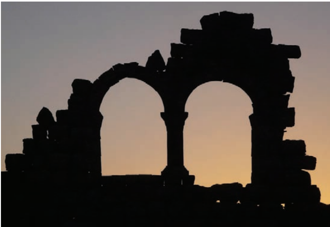
The double windows of House XVIII at Umm el-Jimal at sunrise; all photos courtesy of B. de Vries

Bringing a team of documentation and museum specialists to the site also satisfied the interests of the DoA in two