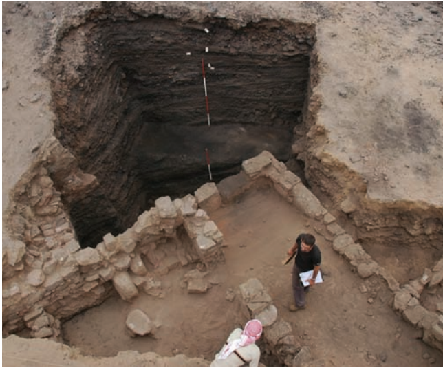
Four-room building associated with massive industrial slag mound in Area M, Khirbat en-Nahas. Over 6.5 m of slag accumulated here with the main phases of copper production dating to the 10 th and 9 th centuries B.C.E.

duction that we tentatively link to the military campaign of the Egyptian Pharaoh Sheshonq (Shishak) I. The radiocarbon dates and 21 st Dynasty Egyptian artifacts found here point to this confluence. A scarab found in these levels is illustrated above. The scarab belongs to an early Iron Age mass produced series made of enstatite, which is foreign to Jordan. According to Stefan Muenger, these originate in the eastern Delta in Egypt, possibly Tanis where they were produced during the reign of the pharaohs Siamun and Sheshonq I in the 10 th century B.C.E. Thus, the archaeometallurgical data show industrial metal production in both the 10 th and 9 th centuries B.C.E. These data, coupled with our earlier work, demonstrate that the Iron Age of southern Jordan is at least 200 years, and possibly as much as 400 years, older than the chronology proposed by Crystal Bennett and other researchers. Our work does not attempt to re-date the Iron Age sites in the highlands of Edom but rather shows that the earliest core area of Iron Age settlement was down in the lowlands near the copper ore resources. This is especially apparent in the ceramic studies carried out by Neil Smith for his UCSD doctoral research on the Iron Age pottery from KEN and other sites excavated by our team.