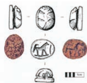
An early Iron Age striding animal scarab found in Area M, Khirbat en-Nahas

Twenty-two high precision radiocarbon dates were processed from the deep sounding and reveal two periods of Iron Age industrial copper production – the 9 th (ca. 3 m) and 10 th century B.C.E. (ca. 2.5 m) and a less intense production period in the basal layers dating from the 13 th to 11 th centuries B.C.E. (ca. 70-75 cm). At the end of the 10 th century B.C.E., there was a disruption in metal pro-