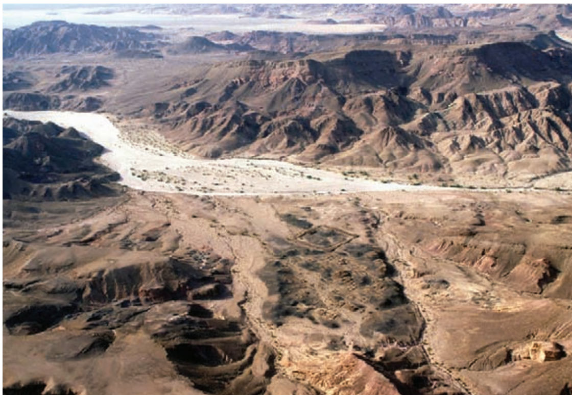
Helicopter view of Khirbat en-Nahas, Jordan. The square feature is the Iron Age fortress; the black color on the site surface represents ancient copper slag mounds

Since 2002 our research in the copper ore rich Faynan region of southern Jordan has focused on the role of metal production on social change during the Iron Age – a period spanning almost 700 years (ca. 1200 to 500 B.C.E.). The Iron Age in the southern Levant follows on the heels of the Late Bronze Age collapse of many civilizations around the eastern Mediterranean, such as the Mycenaeans in Greece and the Hittites in Anatolia. How and why this crisis occurred is poorly understood. During the Late Bronze Age (ca. 1600–1200 B.C.E.), the island of Cyprus was the center of international copper production. However, with the general social upheaval at the end of this period, new opportunities arose for the inhabitants of Faynan that allowed it to become the largest south Levantine metal production center in the following Iron Age. By harnessing the power of copper metal production at the end of the 2 nd millennium and early 1 st millennium B.C.E., the people of southern Jordan were able to establish a remarkable network of mines, smelting centers, agriculture, and trade networks in one of the most arid regions of the Middle East. How did this unprecedented technological expansion come about? How was metal production organized? Who controlled copper production through the Iron Age sequence? These are just some of the key questions our project is exploring.