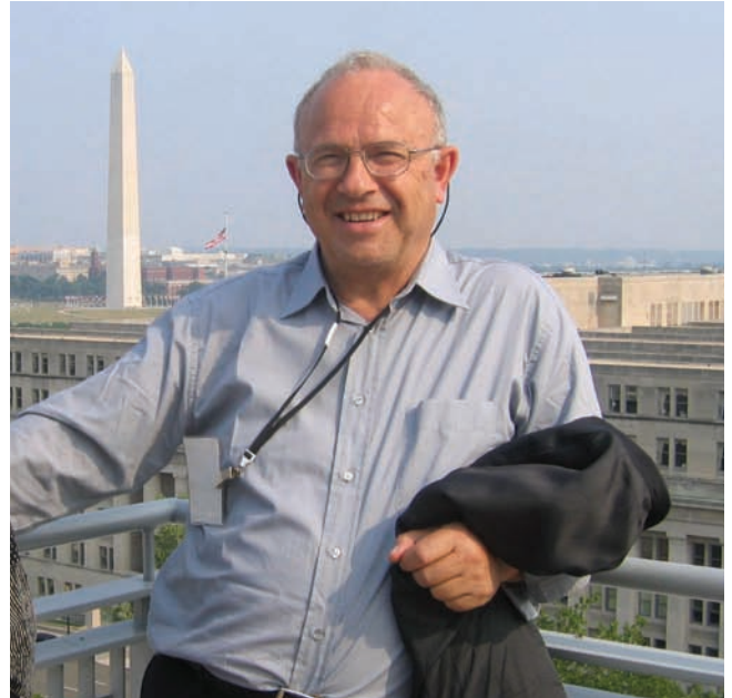
Father Piccirillo attending the ICHAJ 10 conference in May 2007 in Washington, D.C.

Some other important publications by Piccirillo are Umm Al-Rasas Mayfa'ah I (1994) and Mount Nebo: New Archaeological Excavations 1967-1997 (1998), both co-authored with Eugenio Alliata, and The Holy Sites of Jordan (1996), The Madaba Map Centenary 1897-1997 (1999), and L'Arabia