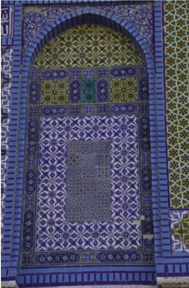
Tiles from the 1961 restoration of the Dome of the Rock