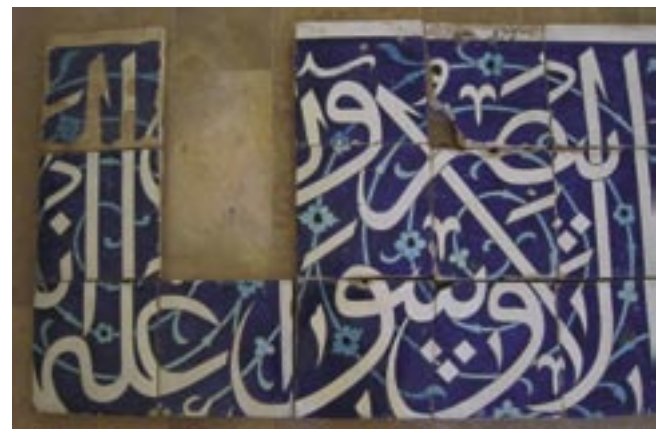
Tiles from the Ya Sin sura, from the octagon parapet of the Dome of the Rock

In the late 1960s or early 1970s, the tiles that remained on site were moved to the Islamic Museum at the Haram al-Sharif. By 2007, all the old tiles had been moved to the outside courtyards (among other places) of the Museum and were stored in poor conditions, exposed to the elements, with pigeons nesting on them, and many were broken. It seems that the tiles were moved when the museum building was under restoration.