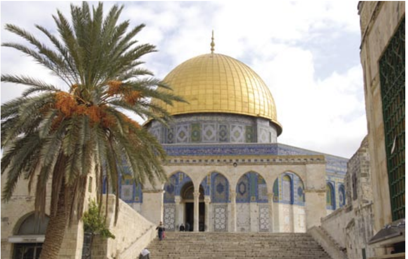
The Dome of the Rock, from the west; all photos by B. St. Laurent

The tiles required restoration and replacement throughout the following four centuries. Multiple restorations of the 18 th and 19 th centuries are recorded in the notebooks known as the qadi sijillat of Jerusalem and kadi sicilleri of Istanbul. During the 20 th century, tiles were replaced as needed, although not always with the requisite concern for maintaining the programmatic integrity of the tile revetment. These additions were a response to the physical necessity for repair, rather than a studied approach to restoring the tiles.