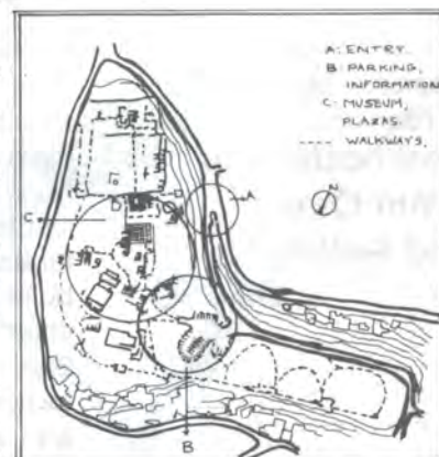
Architect's analysis of Citadel.