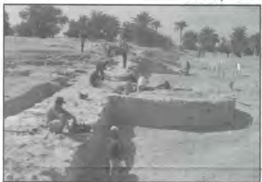
Consolidation of West Wall of Ayla.

The goals are to make Jordan's Islamic heritage more understandable, add cultural features to Aqaba's otherwise one dimensional tourist attraction (the beach) and increase public awareness