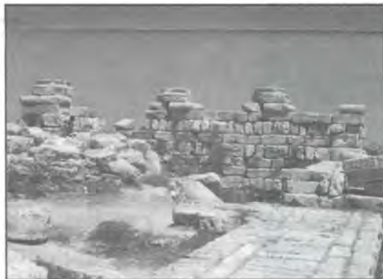
Temple of Hercules.

Probably the most significant discovery is the possible remnant of an Ammonite Temple. Although the limited area of excavation and the disruption by the Romans did not permit the recovery of a plan of the building discovered east of the Roman Temple, the nature of the associated artifacts suggests that the building may have served a communal, possibly cultic function. The other significant result is that inside the Islamic ramparts enough of the foundations and lower courses of the Roman temenos were preserved to reconstruct its entire plan and part of the elevation.