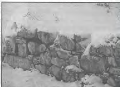
The old: Roman farmstead in front of ACOR in snow.