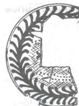
Nabataean painted ware.

Contrary to previous interpretation, the production of Nabataean painted wares did not witness a rapid demise in the post-annexation period. The potential influence of this tradition on the later painted wares of the early Islamic period remains to be explored.