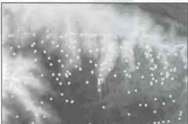
Computer generated digital elevation image of the Wadi Hasa with site locations.

climate and manmade features like roads, toxic dumps and archaeological sites. The result is a tool for powerful analysis and precise description that will render traditional locational descrip-