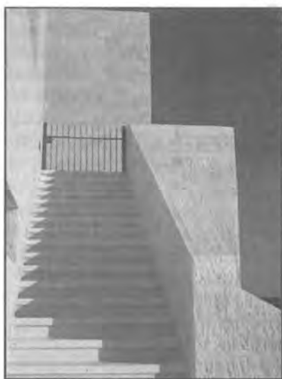
The new: ACOR from the back stairs.

As we cope, I am reminded of two scholars of yore who worked in troubled times. Archimedes did his thinking with such rapt abandon that soldiers surprised him in his bathtub hard at work on a theorem. Sallust withdrew from public life to write history while his contemporaries, Julius Caesar, Catiline, et al, wrought carnage and mayhem. We emulate their priorities. However, we promise not to be caught like Archimedes, but aim to carry on like Sallust.