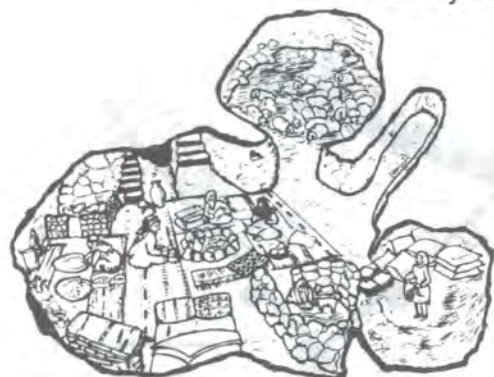
Cave dwelling interior.

The survey of residential uses of caves and rock shelters in Jordan has documented entire villages with such shelters as the primary residences. While today these villages have made the transition to regular housing above ground, as recently as 1952 the Jordan census of housing listed 1,140 cave dwellers on the East Bank, and 2,336 on the West Bank. Amman itself still had 325 families in caves then.