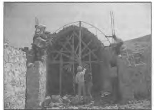
Pella Resthouse in process.

The construction of two resthouses at Pella and Umm Qeis represents a revival of Jordan's traditional architecture, more as labor-intensive construction fully done by the local village community and less as a nostalgic revival of the architectural style of the nineteenth century. The buildings are being designed and constructed concurrently by the author. Part of the Ministry of Tourism's strategy for northern Jordan, the project is funded with a USAID grant and managed by ACOR in conjunction with CRM.